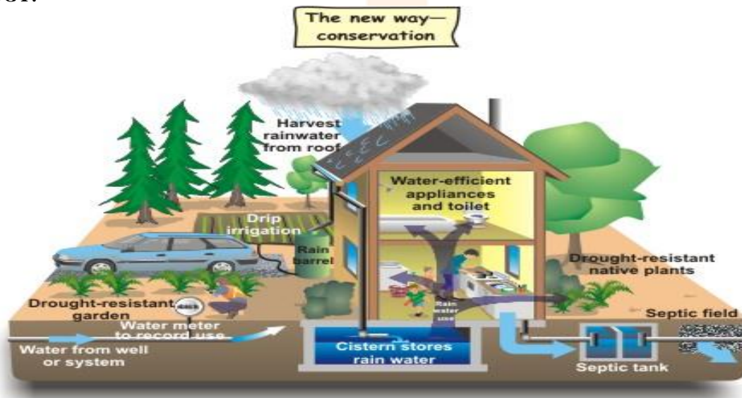
Fig-2: Methodology for rain water bank

To overcome from the problems arises due to water scarcity the rain water which is fall over the roof top of the buildings are collected and stored in the underground storage tanks. This stored water is treated and used during the summer season which will reduce the quantity of water tankers and load over the different projects which is run by the government.