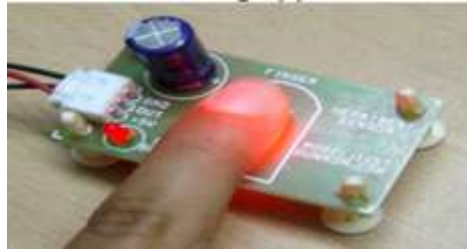
FIGURE 1: HEART BEAT SENSOR