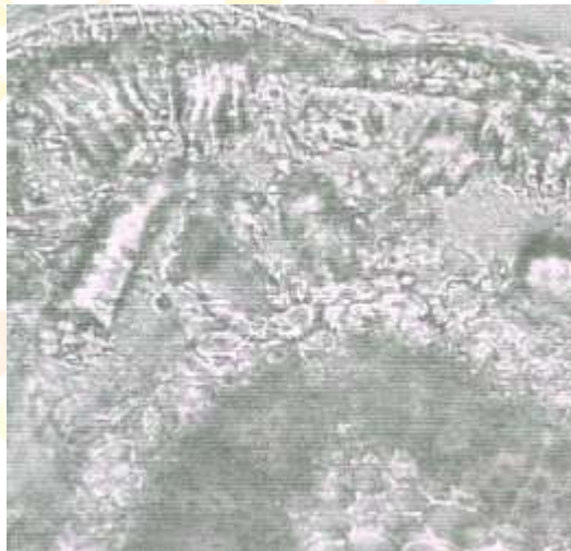
Detailed TS of a branch showing the outer small rectangular epidermal cells followed by oblong cortical parenchyma cells, a zone enclosing bundles of fibres, inner layers of cortex, endodermis, a circle of vascular tissues (dark) and hexagonal pith cells. The epidermis is covered with a thick cuticle.