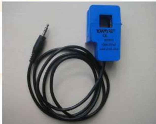
Fig.2 Split-core AC current Sensor.

The Yhdc current transformer is manufactured by Beijing YaoHuadechang Electronic Co., Ltd and is widely available from many stockists as Non-invasive AC current sensor (100A max), Model SCT-013-000. It has no internal burden resistor, but a transient voltage suppressor limits the output voltage in the event of accidental disconnection from the burden. It is capable of developing sufficient voltage to fully drive a 5 V input.