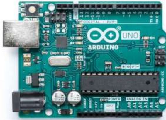
Fig.1 Arduino Uno R3 Development Board.

Arduino Uno is a microcontroller board based on the ATmega328P. It has 14 digital input/output pins (of which 6 can be used as PWM outputs), 6 analog inputs, a 16 MHz quartz crystal, a USB connection, a power jack, an ICSP header and a reset button. It contains everything needed to support the microcontroller; simply connect it to a computer with a USB cable or power it with a AC-to-DC adapter or battery to get started.. The microcontrollers are typically programmed using a dialect of features from the programming languages C and C++. In addition to using traditional compiler tool chains, the Arduino project provides an integrated development environment (IDE) based on the Processing language project.