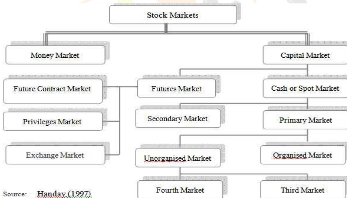
Figure 1. Classification of Stock Markets

provided that a stock is a security that represents a share of ownership on the earnings and assets of the corporation. The stock market, in which claims of the earnings of corporations (shares of stock) are traded, is the most widely followed market in the American economy. Stock markets can be classified as debt and equity markets, short- term debt instruments (money market) and longer-maturity financial assets (capital markets), including cash or spot market and futures markets, as displayed in Figure 1.