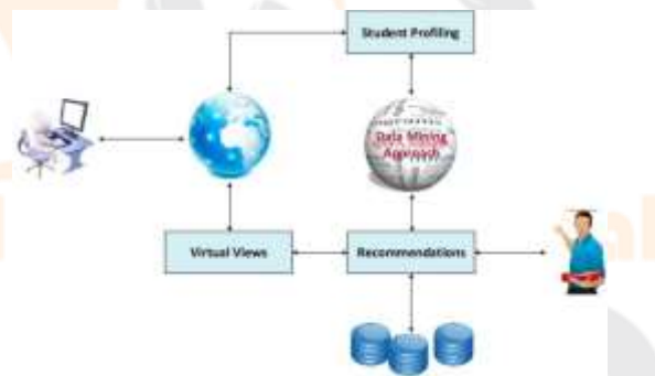
Figure 3: Personalized E-learning Architecture. Source [17]

To allow multiple operating systems, a single hardware host hypervisor is essential. A hypervisor prevents virtual machines from interfering with one another by allocating resources to each element as they are required. In this case, a hypervisor that runs directly on the underlying hardware is the better option. This layer, which serves as an interface to the outside world, provides the PaaS and SaaS cloud users' needs. The instructional coordinators build the virtual PCs, choosing the baseline images and installing the software they've chosen afterward [27]. Thus, standardized web technologies are generated for specific course projects, and learners may connect to the respective VM using the remote network. Figure 3, shows the personalized virtual model for E-Learning.