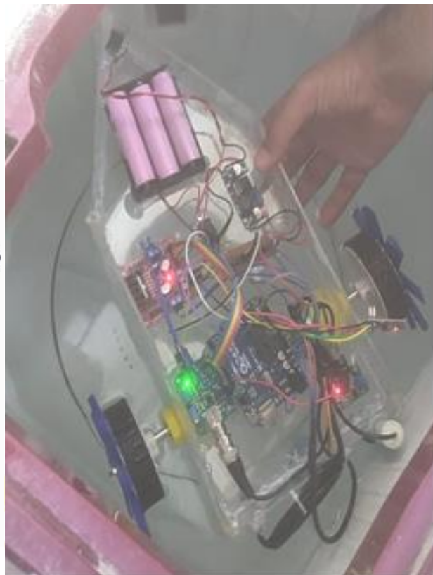
Fig. 2 RC Boat Model