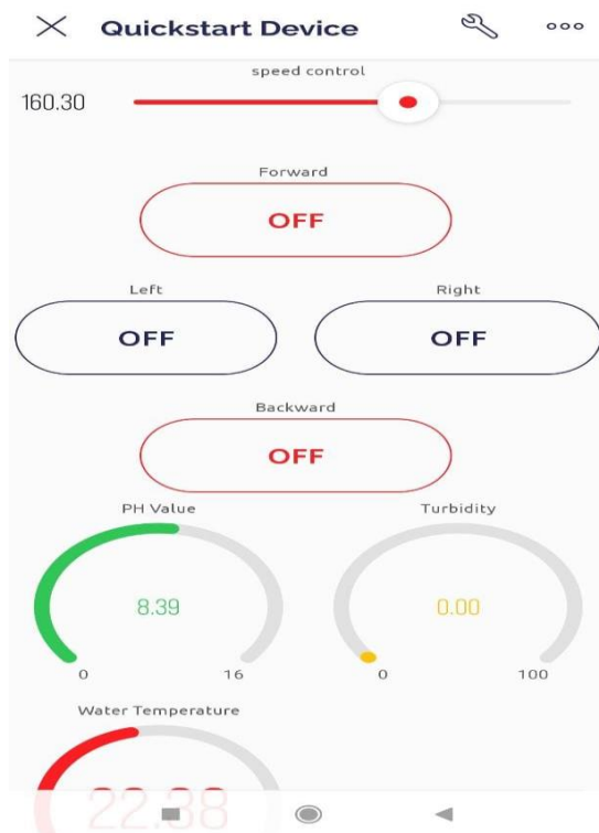
Fig.1 Result Display on Blynk Platform