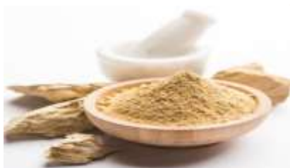
Fig. 6: Multani mitti

Multani mitti helps skin in different ways like minimise pore sizes, removing blackheads and whiteheads, cleansing skin, improving blood circulation, reducing acne and gives a glowing effect to a skin as they contain healthy nutrients. Multani mitti is rich magnesium chloride.