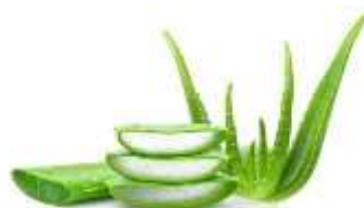
Fig. 3: Aloe vera.

It protects from sun. Onion is a great source of flavonoids as well as an antioxidant vitamins such as A, C and E. nourishes the skin. Prevents skin infection.