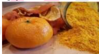
Fig. 5: Orange peels

Orange is a citrus fruit which contains different nutritional source like vitamin C. It also contains calcium, potassium and magnesium. It prevents the skin from free radical damage, skin hydration and oxidative stress. Also it has instant glow property, prevent acne, wrinkles and aging.