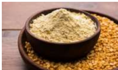
Fig. 6: Gram flour

Gram flour is good for acne-prone skin and can help to lighten any acne scars. It can also be applied all over the body to remove dark spots. It has been used as a base in preparation of herbal scrub.