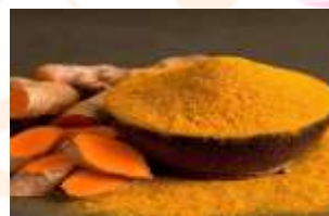
Fig. 4: Turmeric

Turmeric is mainly used to rejuvenate the skin. It delays the signs of aging like wrinkles and also possesses other properties like antibacterial, antiseptic and anti-inflammatory. It is effective in treatment of acne due to its antiseptic and antibacterial properties that fight pimples and provide a glow to your skin. It also reduces the oil secretion by the sebaceous glands. Turmeric widely used condiment and colouring agent. The yellow root Turmeric shows anti-inflammatory property.