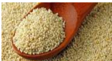
Fig. 7: KhusKhus

KhusKhus is an oilseed obtained from the poppy flower. Poppy seeds (KhusKhus) have strong anti-inflammatory ability, and thus actively used in Ayurvedic preparations for treating inflammation. This magical seed treats sleep disorders like insomnia. If insomnia occurs due to emotional issues such as anger or distress, these can also be treated with Khus Khus. It scores high on several accounts like dietary fibre, minerals (calcium and iron), vitamins, and omega-6 fatty acids. This herb has medicinal properties and thus used in bath soaps for external application.