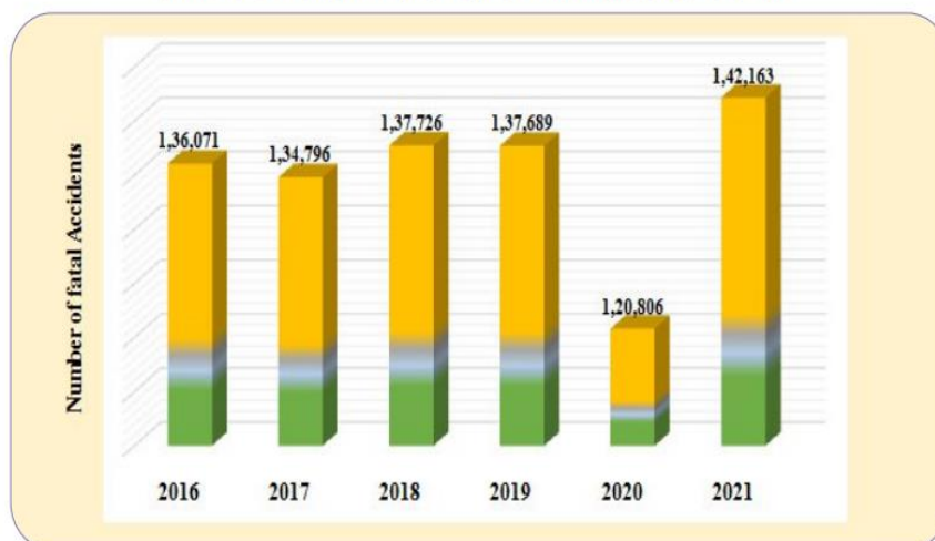
Chart 1.2: Trends in the number of Fatal Accidents: 2016-2021

Data Source: States/UTs (Police Departments).