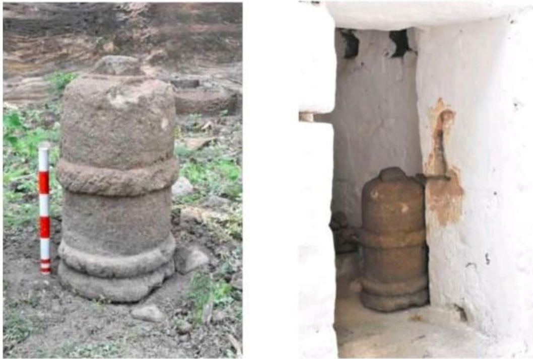
Fig. No. 4 & 5: Votive stupa

Recently Discovered Buddhist Stupa Remains from Tala range of Bandhavgarh Forest, district Umariya Madhya Pradesh