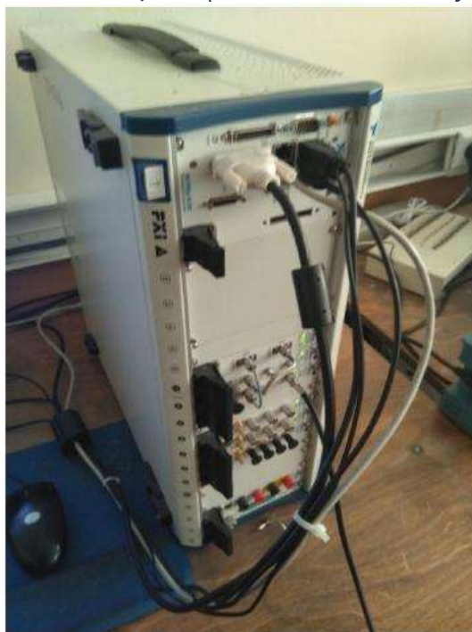
Fig. 2: The used digital oscilloscope type PXI-5114

In this context, our case study aims to explore and highlight the vulnerability of pet wearables to side-channel attacks, focusing on a specific instance involving a now-discontinued dog activity tracker. By implementing an electromagnetic attack during the Base64 encoding process, we were able to successfully exfiltrate data from the device. This revelation prompts a critical examination of the security landscape surrounding pet wearables and the broader implications for the 'Internet of Things.'