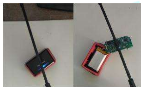
(a) Case intact (b) Case opened

To streamline our data collection and analysis processes, we leveraged the RFS – Soft Front Panel software. This software played a pivotal role in enhancing the efficiency of our experiment, offering a user-friendly interface for configuring and controlling the oscilloscope. Its integration into our methodology facilitated seamless synchronization between the oscilloscope and other equipment, ensuring a coordinated and systematic approach to data acquisition.