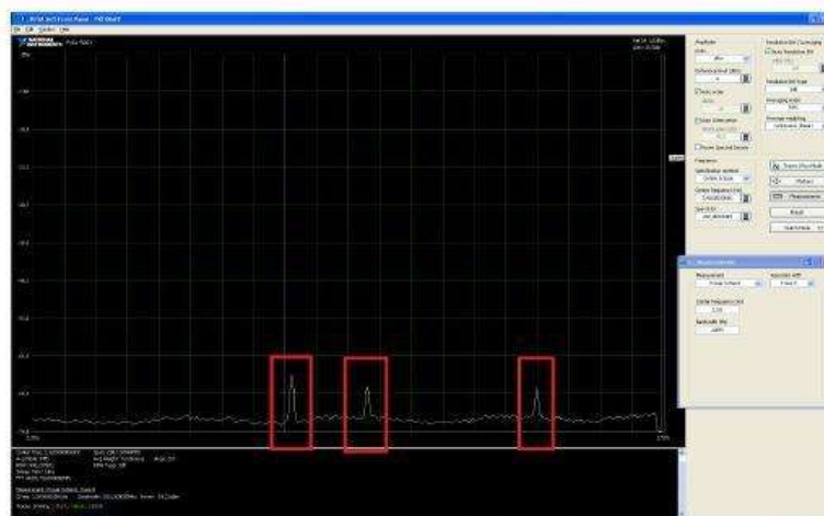
Fig. 4: Bluetooth frequency graph during tracker operation

In conclusion, our Research Methodology for the Side Channel Analysis was meticulously designed and executed, leveraging cutting-edge equipment such as the PXI-5114 digital oscilloscope, an antenna for electromagnetic field measurements, and the RFS – Soft Front Panel software. The detailed examination of signals, coupled with the precision afforded by the oscilloscope's specifications, provided a comprehensive understanding of the security implications in the JSON exchange process. The inclusion of an antenna and the support of software further strengthened the robustness of our methodology, culminating in a thorough and insightful analysis of the Side Channel Analysis.