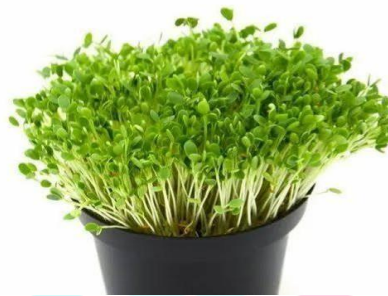
Fig:Microgreens of fenugreek

Fenugreek ( Trigonella foenum-graecum ) is an annual plant belonging to the family Fabaceae . The green leaves and seeds of fenugreek are widely used in food and medicinal applications dating back to ancient times. However, the seeds are sour in taste due to the presence of bitter saponins, which limit their acceptability in foods. It has been possible to decrease the bitter taste of fenugreek seeds by using diverse household processes, such as soaking, germination, boiling, fermentation. Many extracts of each seed or leaf and its active components have been studied for their pharmacological effects and have been reported to have hypocholesterolaemic, antidiabetic, anti-inflammatory, antiulcer, analgesic, antipyretic, CNS-stimulant, antioxidant, wound healing and immune modulatory activity as well as gastro-protective and chemo-preventive activities (A.C. Carr, et al, 1999). Microgreens have piqued consumer interest, especially chefs' of high-end restaurants who use various microgreens, primarily as garnishing elements to enhance salads, soups, sandwiches, and other culinary inventories. However, due to their interesting quality traits, their use has been extended to enrich the diet of a particular group of demanding consumers. (K.B. Pandey, et al, 2009).