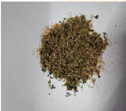
Fig:AIR-DRIED FENUGREEK LEAVES

Sample Growth and Preparation of Fenugreek ( Trigonella foenum-graecum L.) microgreens were grown organically using vermin compost enriched soil under ambient conditions in a polyshade house. A 25g sample of fenugreek seeds (local market, Chennai) was soaked in potable water for 8 hours and sown in furrows of even depth (1inch) in soil filled plastic trays. Trays were kept in darkness in a high moisture (Relative humidity - 90 \pm 5\% ) tunnel located within the polyshade house at a temperature of 30 \pm 5^\circ\text{C} during the first 48 hours of germination.