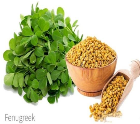
Fig :Fenugreek Seed

Fenugreek ( Trigonella foenum-graecum ) is an annual plant belonging to the family Fabaceae . The green leaves and seeds of fenugreek are widely used in food and medicinal applications dating back to ancient times. However, the seeds are sour in taste due to the presence of bitter saponins, which limit their acceptability in foods. It has been possible to decrease the bitter taste of fenugreek seeds by using diverse household processes, such as soaking, germination, boiling, fermentation. Many extracts of each seed or leaf and its active components have been studied for their pharmacological effects and have been reported to have hypocholesterolaemic, antidiabetic, anti-inflammatory, antiulcer, analgesic, antipyretic, CNS-stimulant, antioxidant, wound healing and immune modulatory activity as well as gastro-protective and chemo-preventive activities (A.C. Carr, et al, 1999). Microgreens have piqued consumer interest, especially chefs' of high-end restaurants who use various microgreens, primarily as garnishing elements to enhance salads, soups, sandwiches, and other culinary inventories. However, due to their interesting quality traits, their use has been extended to enrich the diet of a particular group of demanding consumers. (K.B. Pandey, et al, 2009).