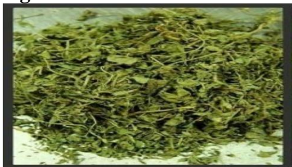
Fig:DRIED FENUGREEK LEAVES Fig:FENUGREEK GREENS POWDER

has removed by air-drying under shade for 15 days. The leaves have subsequently dried in a hot air-oven at 50 °C for 4 h, homogenized to a fine powder and then stored at 4 °C.