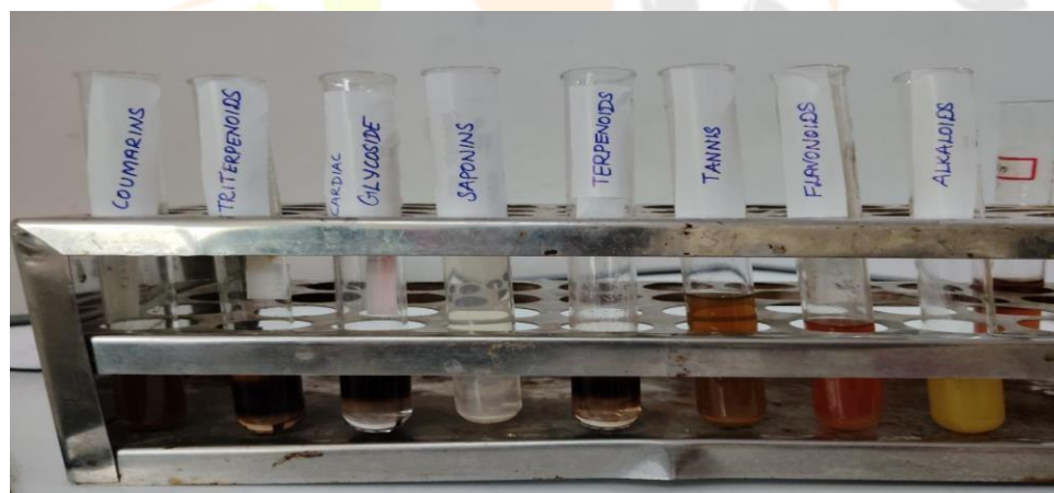
Fig: Qualitative analysis of phytochemicals present in methanol extract.

Quantitative estimation of flavonoids, phenols and alkaloids were estimated using standard protocols and the units were represented respectively.