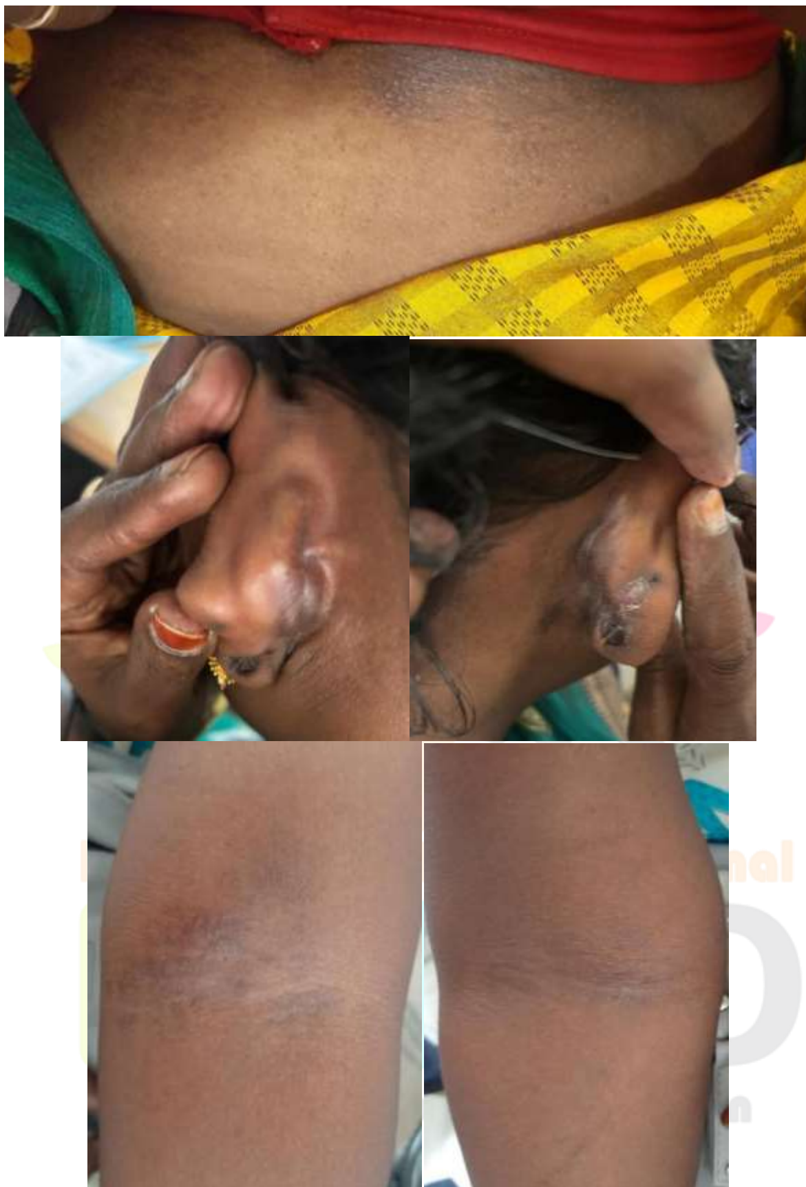
Figure 2: After treatment (18/09/2024)