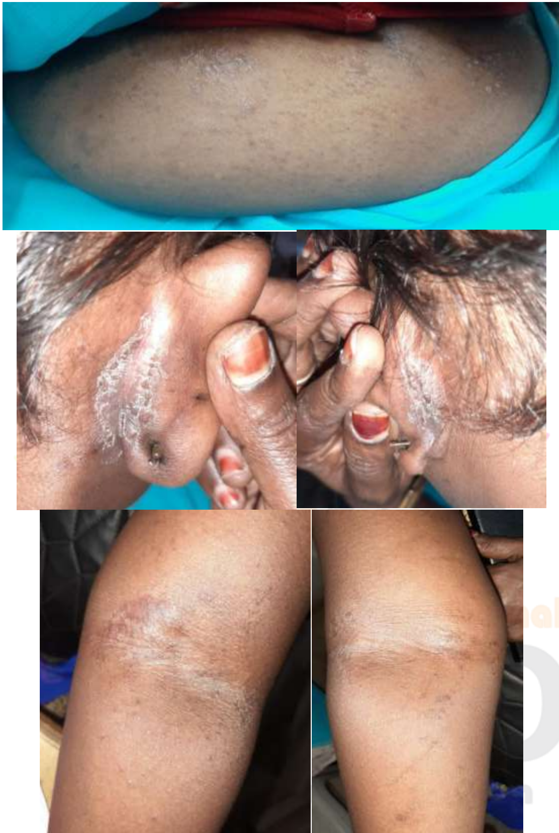
Figure 1: Before treatment (24/07/2024)