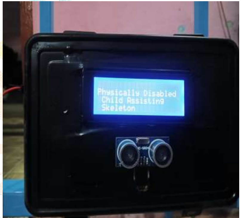
fig – 4: result diagram