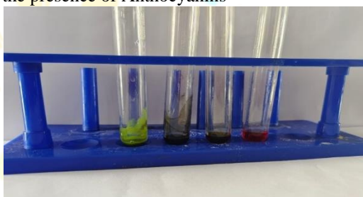
Fig: 2 Phytochemical Tests