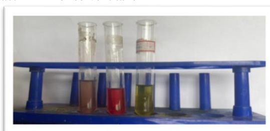
Fig: 1 Test for Acid Base Results (Colour Changes of the Plant Extract in Various pH Solutions)