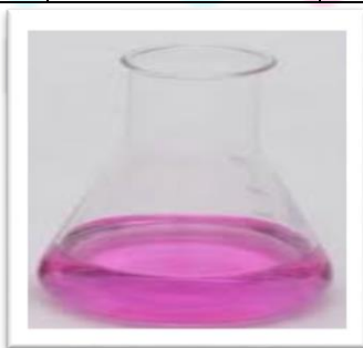
Fig: 3 Assay of Benzoic Acid Using Phenolphthalein Indicator (Each ml of 0.1N NaOH is equivalent to 0.01221g of benzoic acid)