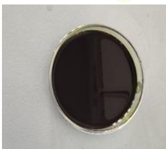
Fig. Ficus extract