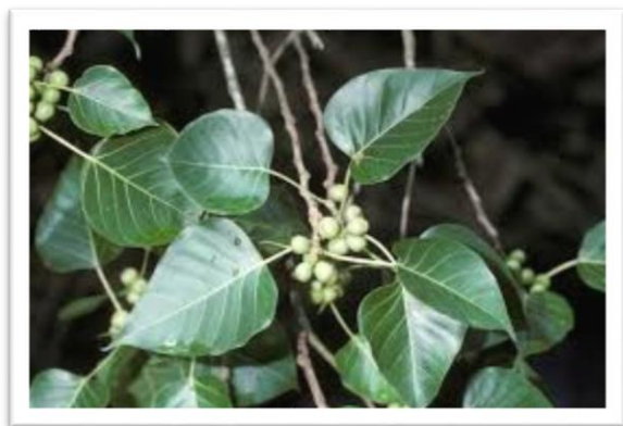
Figure 1: Peepal Leaves

When combined in a polyherbal gel formulation, Aloe vera and Ficus religiosa work synergistically to enhance wound healing. Aloe vera improves hydration and speeds up wound closure, while Ficus religiosa provides antioxidant and antibacterial properties, making the combination a promising natural treatment for efficient wound healing (1).