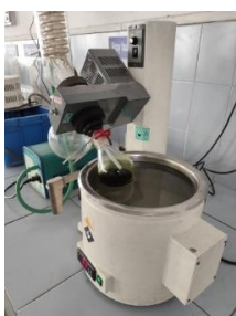
Fig. 3: Concentration via rotary evaporator.