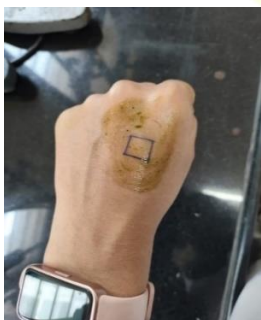
Skin Irritation Test

The skin irritation (patch test) was performed to assess the dermal safety of the polyherbal wound healing gel. A small amount of gel was applied to a 1 cm × 1 cm area on the forearm of a healthy volunteer. The area was covered with sterile gauze and observed for 24 hours for any signs of redness, itching, swelling, or irritation. No adverse reactions were observed, indicating that the formulation is safe for topical use.