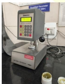
Fig. Gel viscosity test on Brookfield viscometer

The viscosity of the gel was measured using a Brookfield Viscometer (Model: CAP 2000+). Spindle number 01 was used at a speed of 50 rpm with a shear rate of 667, and measurements were recorded for 1 minute at a controlled temperature of 26-27°C. The viscosity values indicated a moderately viscous gel suitable for easy application without being too runny.