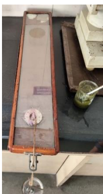
Fig. Spreadability Apparatus

Where S is the spreadability, M is the applied weight (g), L is the length moved by the glass slide (cm), and T is the time (sec). The gel showed good spreadability, ensuring ease of application without excessive dripping.