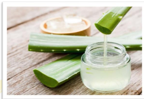
Figure 2: Aloe Vera Gel