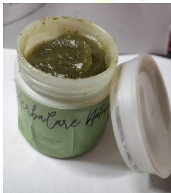
Fig. Final polyherbal wound healing gel formulation

For the preparation of the gel, Carbopol 940 was first dispersed in distilled water and allowed to swell overnight for complete hydration. Glycerin and methylparaben were then added to the hydrated Carbopol solution under continuous stirring. The ethanolic extract of Ficus religiosa leaves (obtained through ultrasound-assisted extraction) and Aloe vera gel were slowly incorporated into the gel base with continuous stirring to ensure uniform mixing. During the incorporation of Aloe vera gel, Vitamin E was also added as an antioxidant to help stabilize the formulation by preventing oxidative degradation of the gel components. Finally, triethanolamine was added dropwise to adjust the pH of the formulation to a range of 6.0 to 7.0, resulting in the formation of a smooth and transparent gel. The formulated polyherbal gel was then transferred into sterilized containers and stored at an appropriate temperature for further evaluation (1,2).