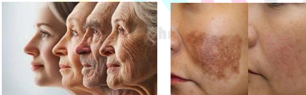
Figure No. 1: Visible Effects of Wrinkles and Hyperpigmentation on the Skin (2)

Keywords: Polyherbal, Psidium guajava, Daucus carota, facial serum, skin rejuvenation, UV protection, antioxidants.