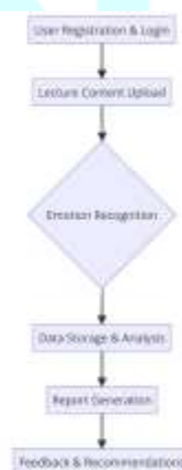
Figure. 2 Implementation result

The diagram represents a process flow for an emotion recognition system in an educational setting. It begins with User Registration & Login, where students, teachers, or administrators create accounts and access the system. Next, in the Lecture Content Upload phase, lecturers upload educational materials such as videos, presentations, or documents. The core of the system is Emotion Recognition, where students' emotions are analyzed in real time through video or audio inputs to detect feelings like engagement,