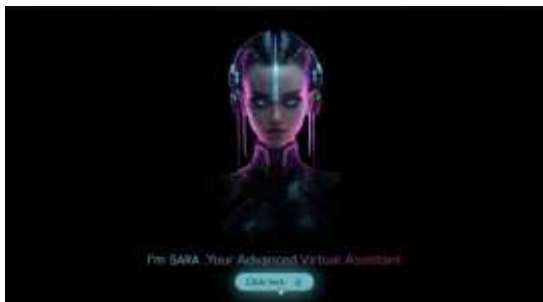
Fig. 2. The Snapshot of Project.

The user interface (UI) of the SARA Operating System was built using the MERN stack, ensuring seamless interaction with the backend. React.js was employed to create dynamic components that would reflect real-time changes based on user inputs, while Node.js served as the backend server for API communication. The interface featured essential system functions, such as voice command feedback, a status display, and a notification system for ongoing processes or alerts. The UI was designed to be minimal yet user-friendly, providing users with immediate access to SARA's capabilities and offering an efficient way to manage various tasks without requiring complex interactions.