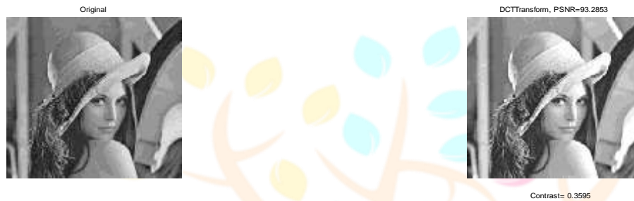
Fig.no.4 Discrete Cosine Transform O/P

For obtaining better result different scaling factors are analyzed and best scaling factors are used to enhance the image.