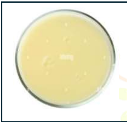
Fig 5., yellow paraffine