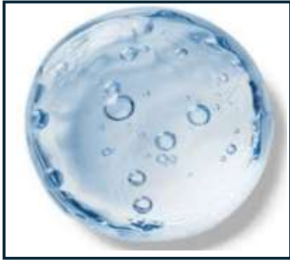
Fig 3., glycerine