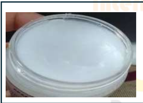
Fig 7:whiite vaselline