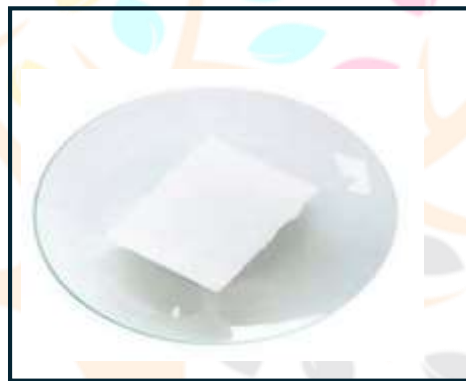
Fig 6: white soft paraffine