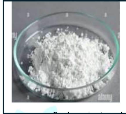
fig 4., cetostearyl alcohol