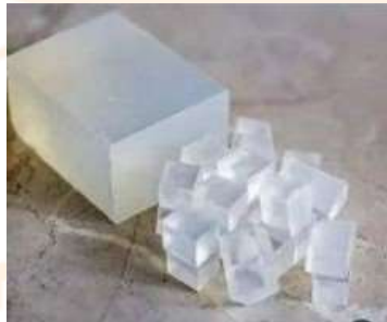
Figure no 6. soap Base

Glycerine soap bases are transparent and rich in glycerine, functioning as an effective moisturizer that improves skin hydration, reduces dryness, rejuvenates the skin's surface, preserves moisture, and is suitable for all skin types.