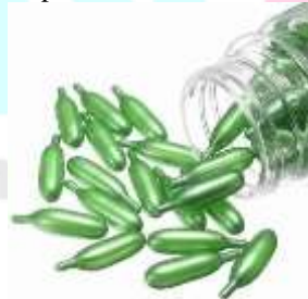
Figure no 4. Vitamin e capsule

Characteristics: Revitalizes and hydrates dry skin, provides moisture, counters early signs of aging, diminishes dark spots, and functions as a cleansing agent.