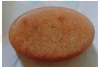
Figure no 13. scrub soap

Moulds should be left at room temperature for 30 minutes before removing the soap from the.