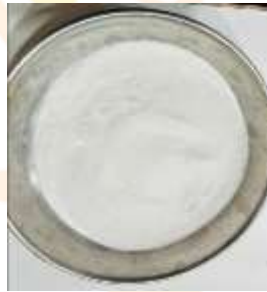
Figure no 11. Rice powder

Rice powder provides numerous advantages for the skin, such as exfoliation, oil regulation, anti-inflammatory properties, and skin brightening. Additionally, it aids in diminishing the visibility of dark spots, evening out skin tone, and offering protection against sun damage.