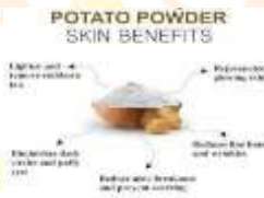
Figure no 8. Potato powder

The Solanaceae family, commonly known as nightshades, includes potato powder, which possesses properties that may diminish melanin production, resulting in a lighter and more radiant complexion. Additionally, it aids in the reduction of acne scars and other imperfections, promoting a more uniform skin tone. Furthermore, potato powder is recognized for its anti-aging benefits.