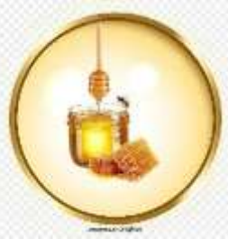
Figure no 9. Honey

Geographical Source: Honey is plentiful in regions such as Africa India, Jamaica, Australia, California, Chile, Great Britain, and New Zealand.