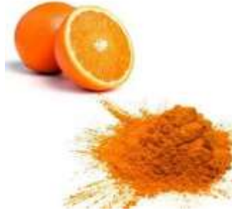
Figure no 7. Orange peel powder