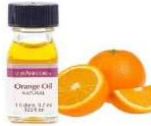
Figure no 10. Orange oil