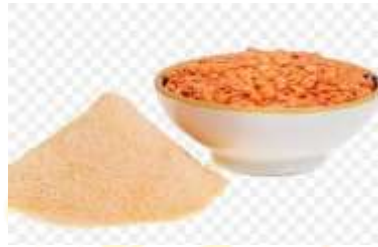
Figure no 5. Red lentil

Biological Origin: The lentil is a diminutive legume seed classified under the lens culinaris species. Family: Fabaceae and Papilionaceae.