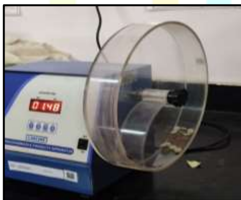
Fig 4: Friability Test