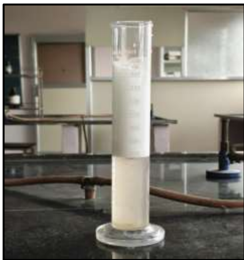
Fig 6: Foam Test