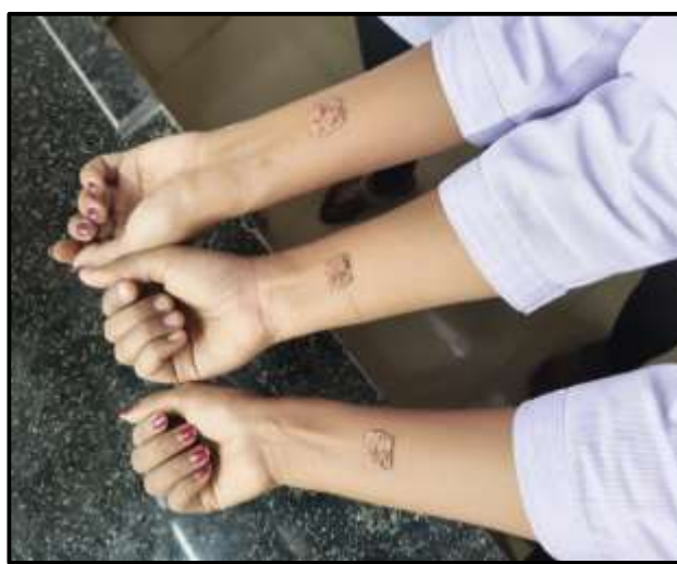
Fig 7: Skin Irritation Test