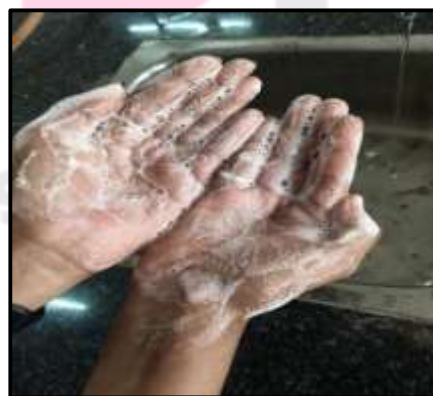
Fig 5: Washability