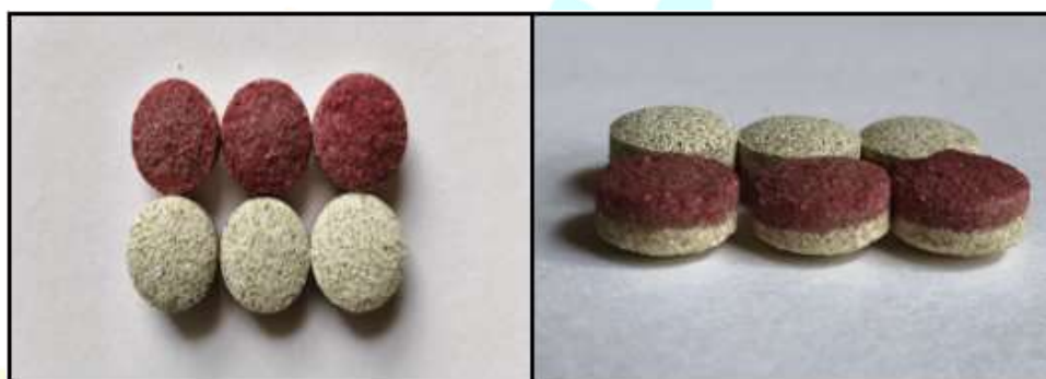
Fig 1: Polyherbal Facewash Tablet