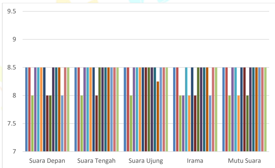
Figure 2. Diagram of Cooing Quality of 15 Zebra Doves in Five Categories (1 front voice, 2 middle voice, 3 end voice, 4 Rhythm and 5 Voice Quality).

The numbers of Figure 1 indicate the individual Zebra Dove number, the black box indicates that the Zebra Dove does not reproduce, the yellow box indicates that half of the offspring population has cooing like its parent, the green box indicates that the offspring cooing is stable from generation to generation and the red box indicates that the offspring cooing varies. The quality of the Zebra Dove cooing is assessed in 5 (five) categories, namely front voice, middle voice, end voice, rhythm, and voice quality. Front voice, with the criteria of length, swinging/bending, and clean. Middle voice, with the criteria of pressure, complete, and clear. End voice, with the criteria of round, long, and swinging. Rhythm, with the criteria of loose, graceful, elegant, and beautiful. Voice quality/basic, with the criteria of thick, dry, clean/clear, and nasal (ng), Scoring for each category consecutively starts from 8, 8.5, 8.75, and 9 if it is truly maximum (Decision of the 2022 P3SI National Conference: 39). The results of the evaluation of the quality of the cooing of 15 Zebra Dove offspring taken randomly showed that the quality of the cooing was still low with a score between 8 and 8.5. The minimum score to be categorized as good is 8.75 or equivalent to 43.75. Figures 2 and 3 show the results of the evaluation of the quality of the cooing of 15 Zebra Dove offspring taken randomly.