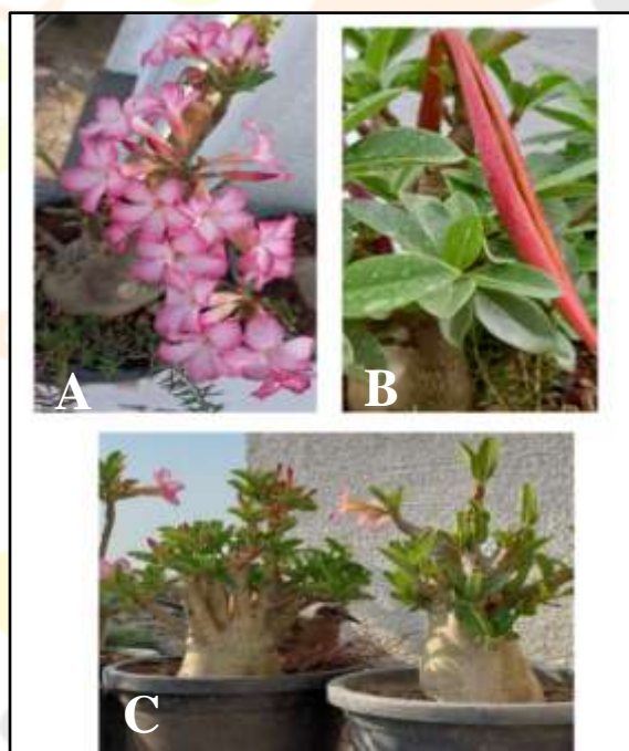
Figure 1. Photographic Representation of the Adenium arabicum A) Flowers of Adenium arabicum B) Seed Pod of Adenium arabicum C) Whole plant of Adenium arabicum

Fresh Plants of Adenium arabicum were procured from an online store and subsequently identified and authenticated by a qualified botanist at the Department of Botany, Dr. Babasaheb Ambedkar Marathwada University, Chhatrapati Sambhajnagar, Maharashtra, India.