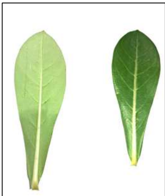
Figure 2. Dorsal (Adaxial) and Ventral (Abaxial) Surfaces of Adenium arabicum Leaf showing its shape, venation pattern, and surface texture.

The dorsal and ventral leaf surfaces are shown in Figure 2 .