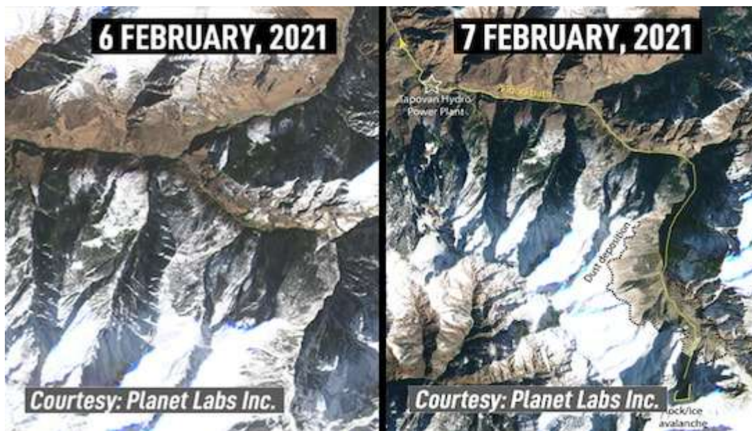
fig. 4.1 satellite before-and-after imagery showing the scar left on ronti peak and the flood's muddy fingerprint down the valley. 55

Long-term fallout lingers. Rivers still choke on sediment, raising the risk of future flash floods. 53 Locals speak of quieter winters, fewer tourists, and a gnawing fear every time clouds gather over the peaks. 54