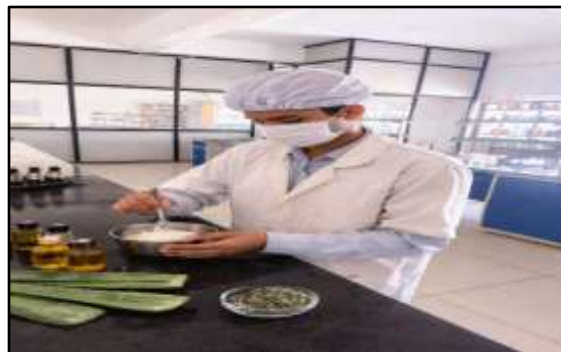
Fig. No. 8: Method of Preparation