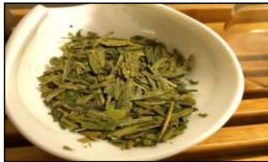
Fig. No. 1: Green Tea