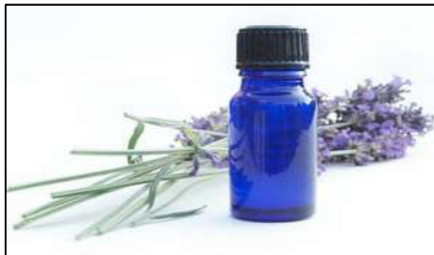
Fig. No. 7: Lavender Oil

All materials were of suitable cosmetic grade and used without further purification.