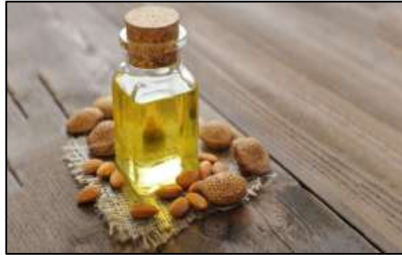
Fig. No. 4: Almond Oil