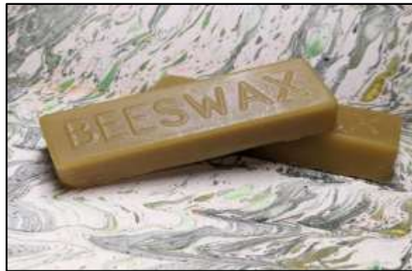
Fig. No. 5: Beeswax