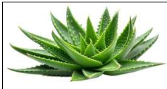
Fig. No. 2: Aloe Vera