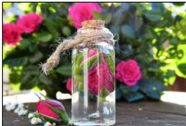
Fig. No. 6: Rose Water