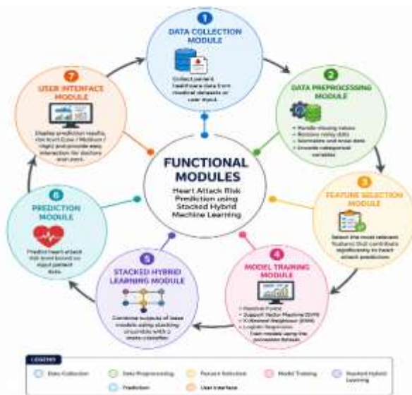
FIG. 1.STEM ARCHITECTURE