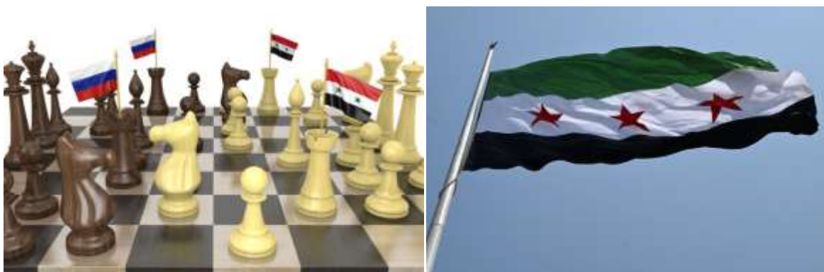
Figure 1: Conceptual Framework – War, Wealth, and World Order

Geopolitics emphasizes spatial strategy, including control over territory, infrastructure, and regional networks. Syria's geographic position—connecting the Middle East, Mediterranean, and Eurasia—makes it strategically valuable for power projection.