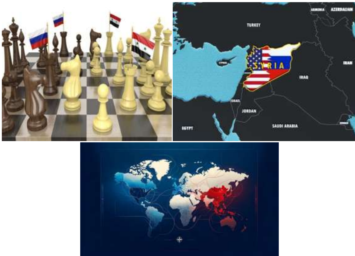
Figure 3. Network diagram illustrating Russia’s geopolitical relationships and influence in the Syrian conflict.