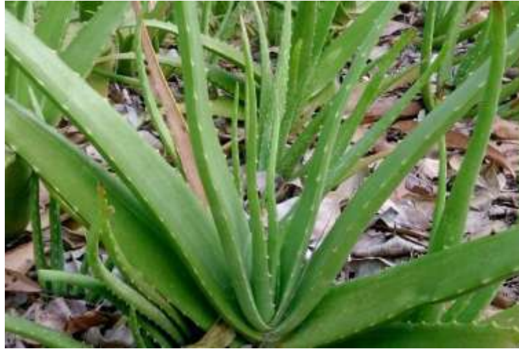
Fig No: 4 Aloe Vera plant

6) Reducing bacterial and fungal issues: Aloe Vera has antibacterial and antifungal properties that can help prevent dandruff and other bacterial and fungal issues in the scalp.