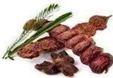
Fig No: 6Shikakai