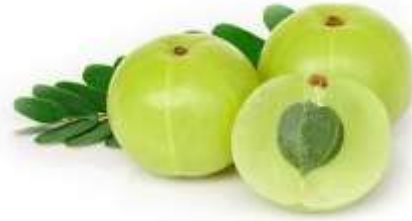
Fig No: 5Amla