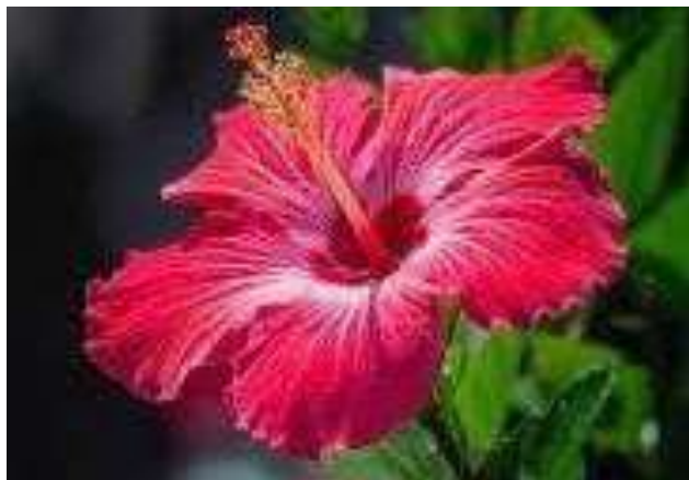
Fig No: 2 Hibiscus Flower