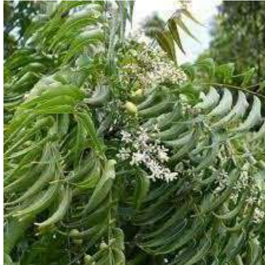
Fig No: 3 Neem Plant